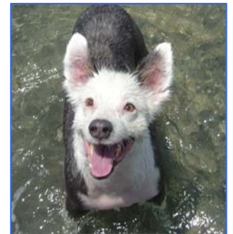
Sydney says, Sponsors make me smile!